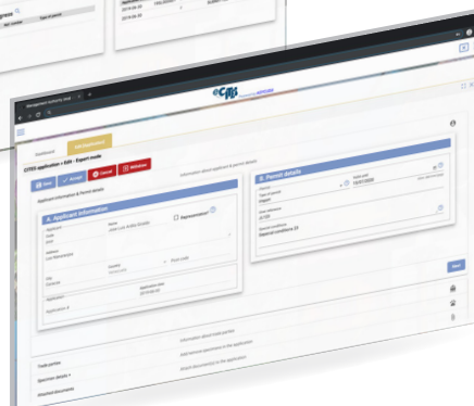
Electronic application form