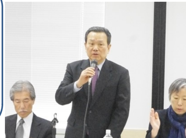
Japan Eel Importers Association

Was requesting China would not resume re-exports of A. anguilla (allegedly sourced from North Africa)