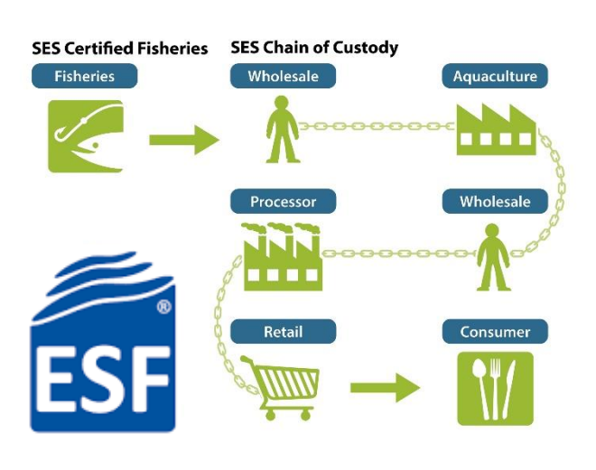
Certified sustainable product